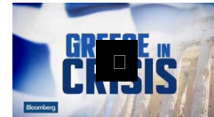
Greece's Varoufakis to Quit if Cuts OK'd