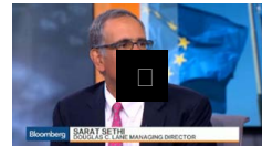
How to Trade Markets During Greece Crisis