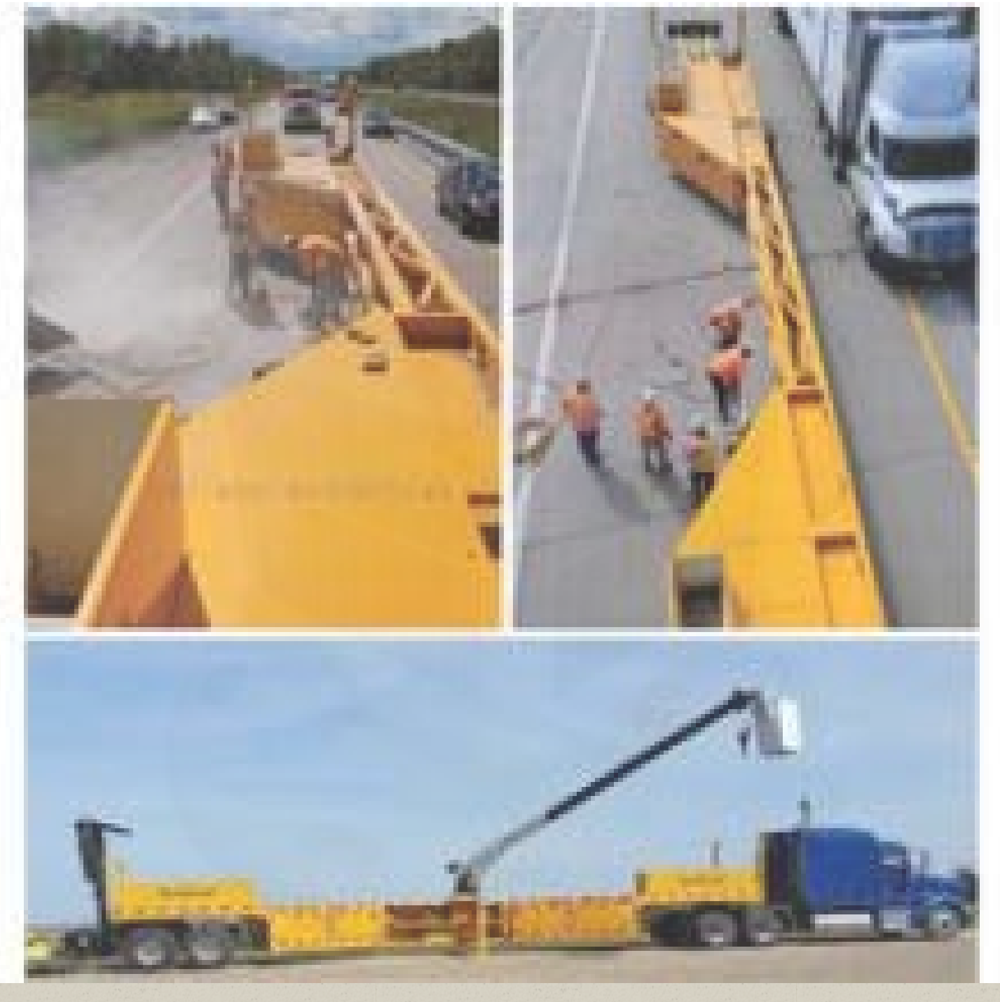
CRANE & BUCKET OPTION