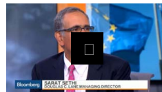
How to Trade Markets During Greece Crisis