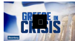
Greece's Varoufakis to Quit if Cuts OK'd