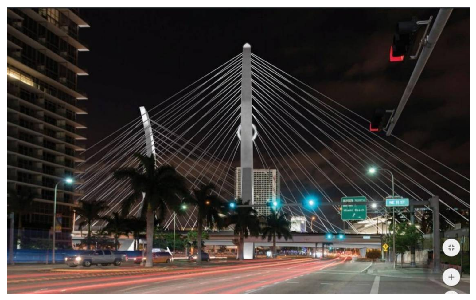
A rendering of the proposal for the I-395 bridge submitted by Fluor-Astaldi-MCM, which was rated second place by a slim margin by the Florida Department of Transportation.

As Friday's committee made that final decision, no member of the public or local government had seen the competing proposals because they were cloaked in the Florida Department of Transportation's "cone of silence," rules meant to keep lobbying out of the selection process. The agency, following what it says are routine procedures, released the proposals and bridge designs only after the decision was already made.